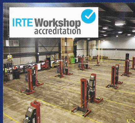
IRTE ACCREDITED WORKSHOP