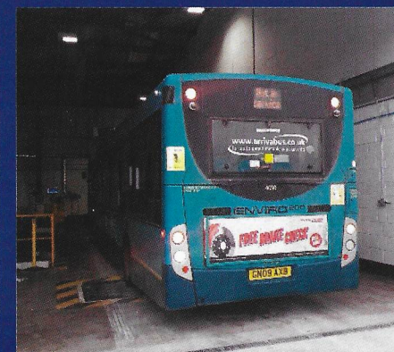
ROLLER BRAKE TESTING